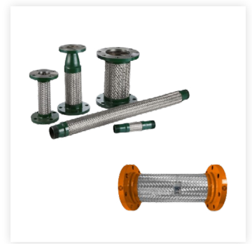
Flexible Hose Assemblies