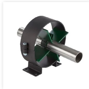
Anchors & Guides