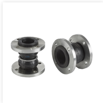
Rubber Expansion Joints