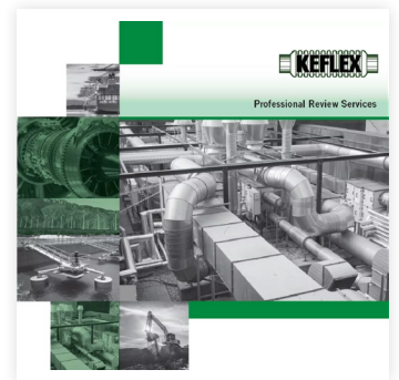
Delegated Design Service