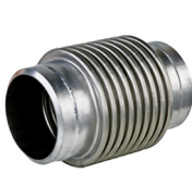
Custom Bellows Solutions