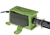
Landing Gear Solenoid