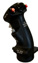
Cobra Flight Control Grip