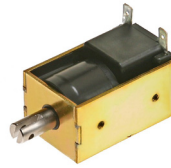
AC & DC Frame Solenoids