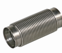
Rapid Prototype Production