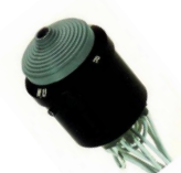
TripleX 4 Way Switch