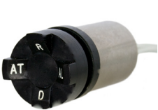
5 Way Mini Switch