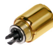
Long-Life Tubular Solenoids