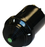
MS 4 Way Switch