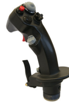
F-16 Flight Control Grip