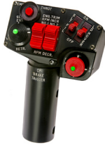
CH-46 Flight Control Grip